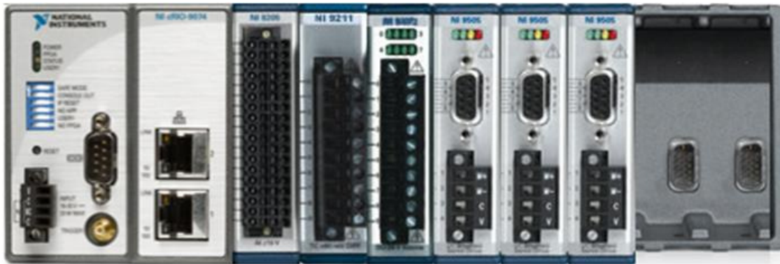
Fig. 2 - National Instruments cRIO

speed IO capability with the FPGA as well as real-time controller functionality that can both be programmed using LabView. The real time controller in the cRIO will be used to host the LabView web server as well as running control loops. The FPGA in the cRIO will be used as an interface between the real-time controller and the IO to allow for high speed IO control that may be desired in the future. The cRIO also offers many IO card options for interfacing directly to hardware without the need to add additional conditioning electronics. Figure 2 shows the cRIO with the cards installed that will be used for the project.